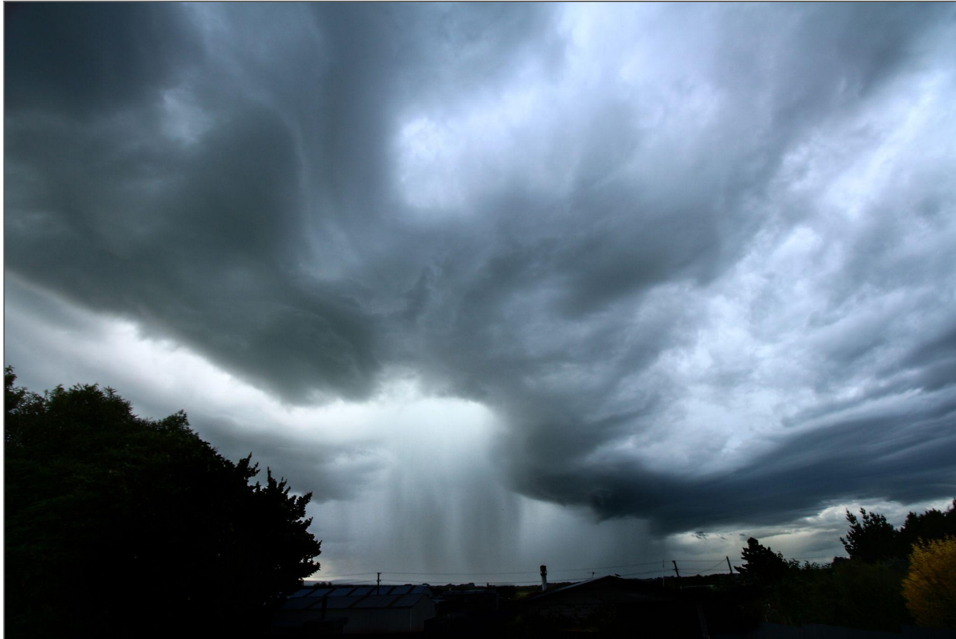
Caption: Storm approaching in Thornbury, Southland, new Zealand. 01/31/2023