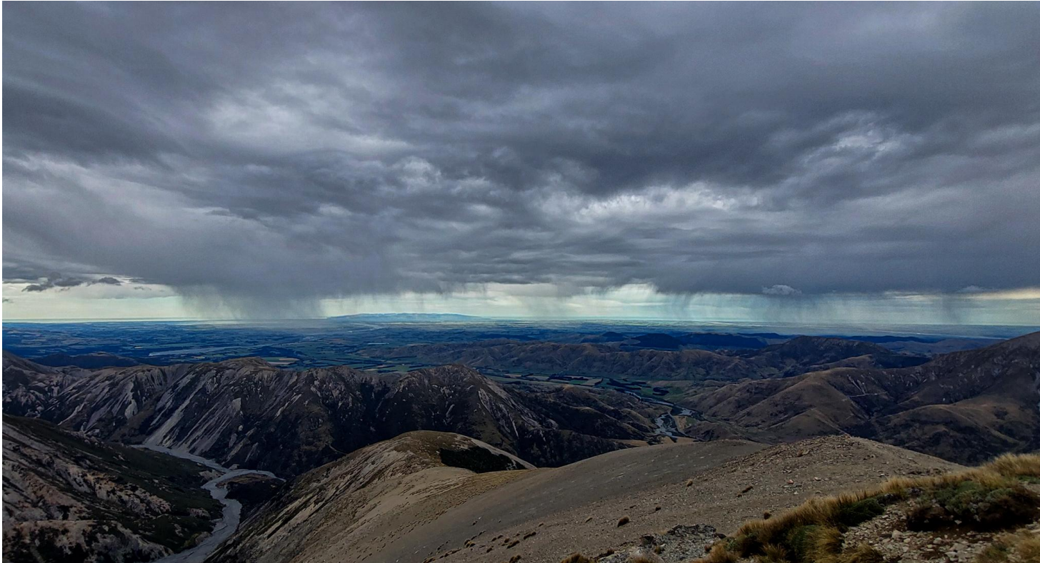
Caption: 'Storms about to embrace the main divide' From the Foggy Peak, Porters Pass. Taken on March 25th 2023.